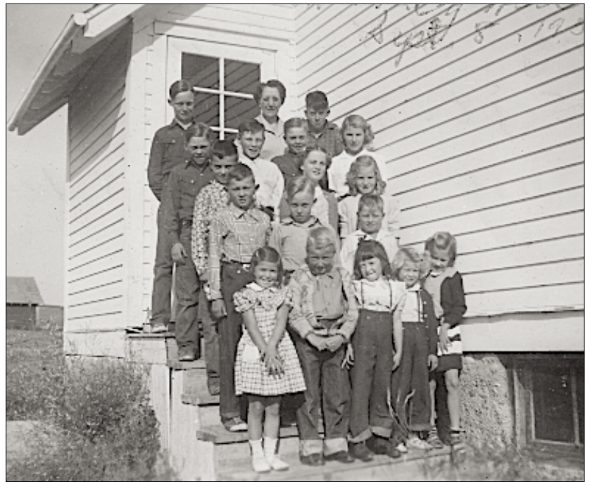
FIRST DAY AT SCHOOL – 8 SEPTEMBER, 1952 GRADE ONE CLASS AT FRONT WITH THE AUTHOR ON THE LEFT

Windy Hill was a one-room school accommodating grades one to eight with separate entrances for girls and boys. The boys' cloakroom had the stairway to the basement where the coal furnace was housed. This was a great place to